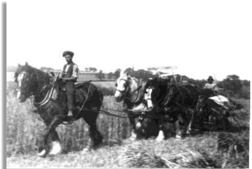
Ploughing in Robertsbridge – c. 1920