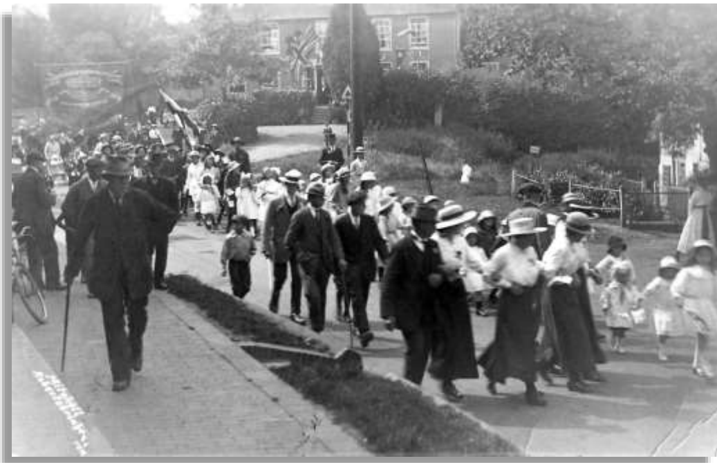
Robertsbridge Peace Celebration March and Rally- 1918.