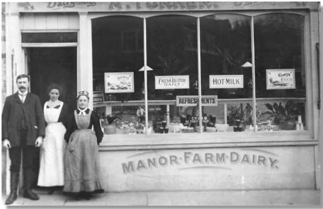
A Turner Family shop – where?