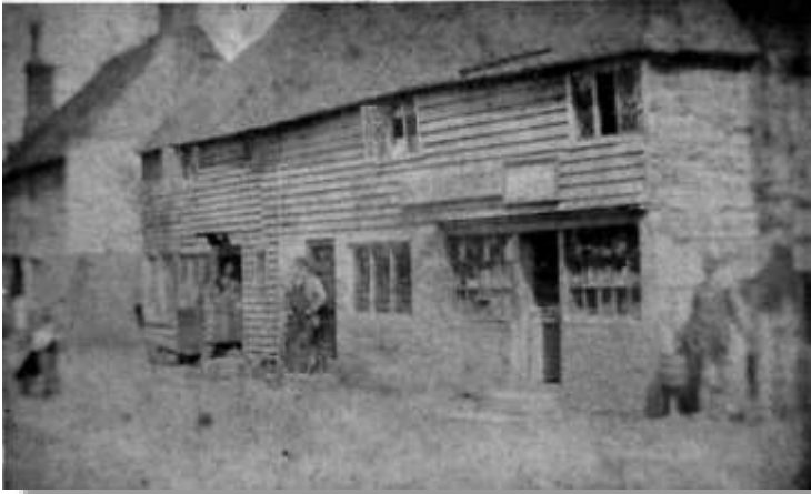
Early photo – c.1880 of terrace of cottages which subsequently became the Post office.