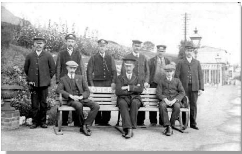
Station staff c. 1900

Hop Picking c. 1900 – possibly a posed photo judging by their dress.