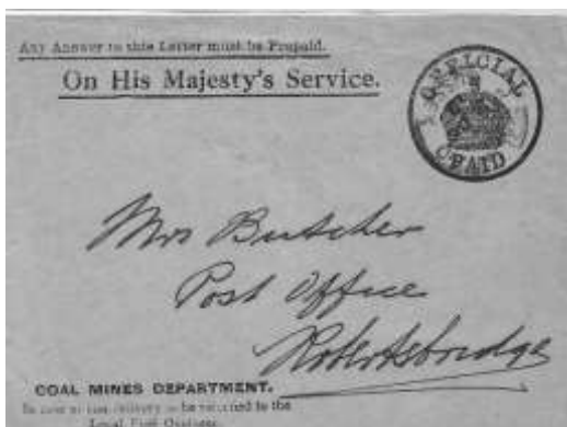
Requisition agreement for coal supply for the Congregational Church – October 1918. Coal was still on ration.