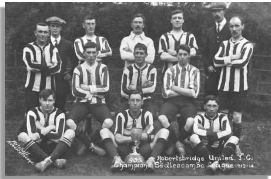
Robertsbridge United F. C. – Champions Sedlescombe League 1913/14